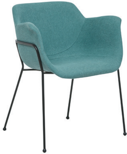
Occasional Chairs - GlobeWest