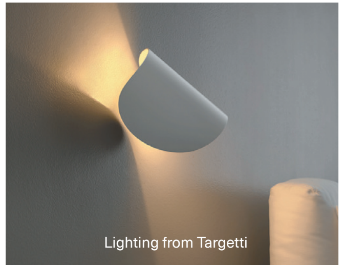
Lighting from Targetti