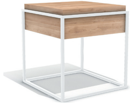
Selection of Bedside