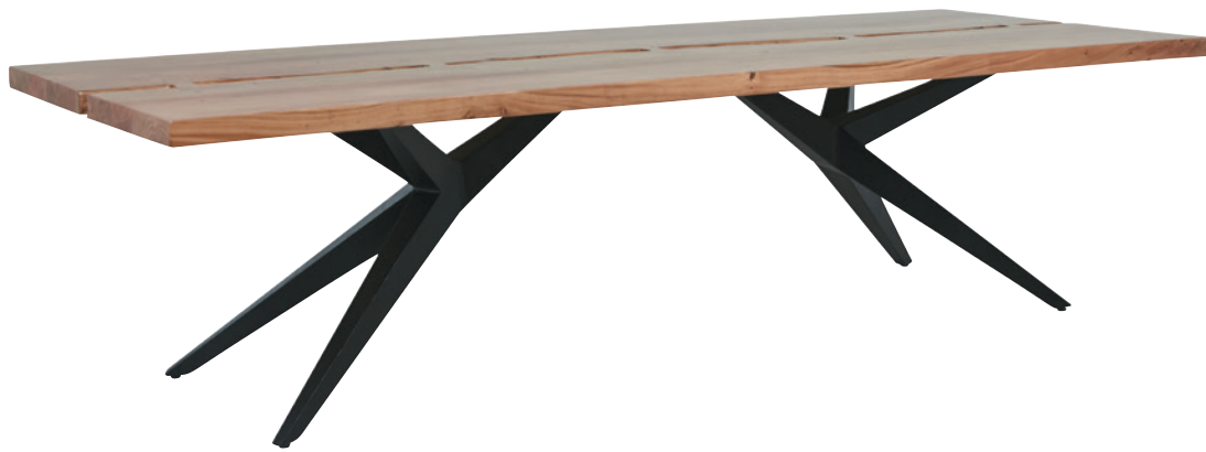
Shelter Modern Table - GlobeWest