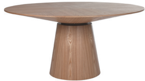
Classique from GlobeWest