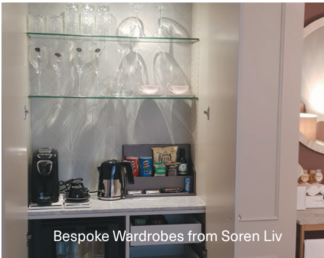
Bespoke Wardrobes from Soren Liv