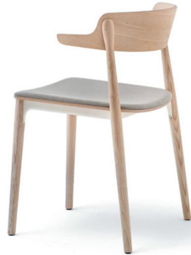
Pedrali Chairs from Italy