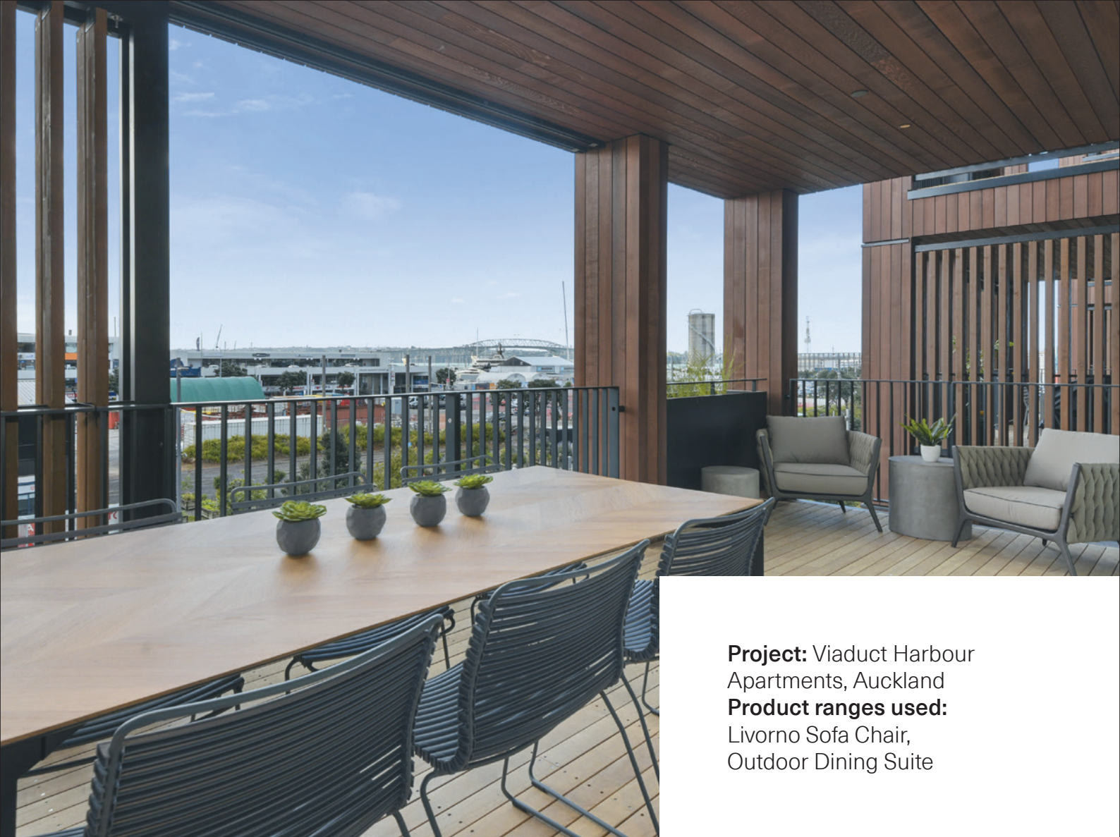
Project: Viaduct Harbour Apartments, Auckland Product ranges used: Livorno Sofa Chair, Outdoor Dining Suite