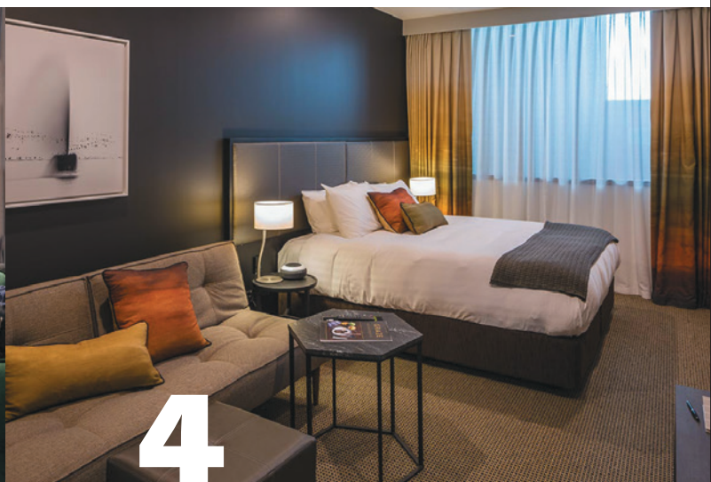
Our Projects and Experience