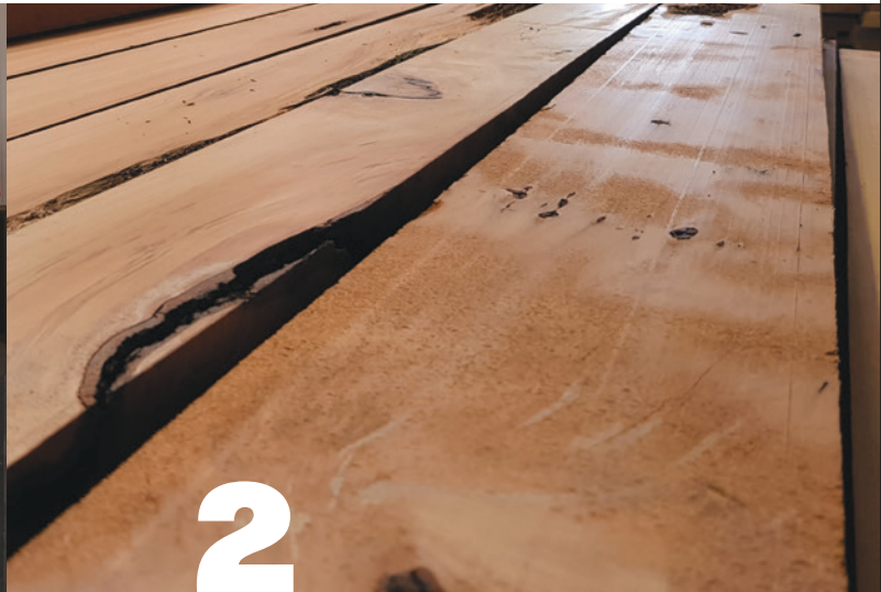
Our Process & Manufacturing