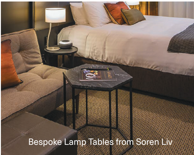
Bespoke Lamp Tables from Soren Liv