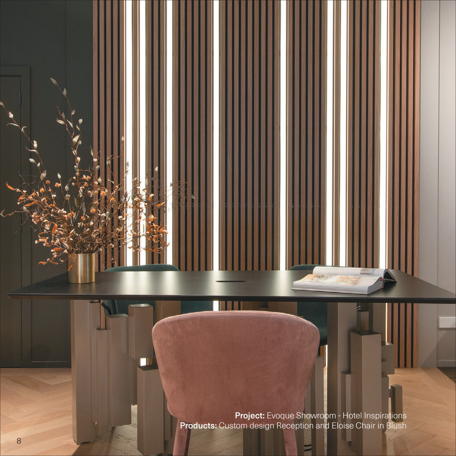
Project: Evoque Showroom - Hotel Inspirations Products: Custom design Reception and Eloise Chair in Blush