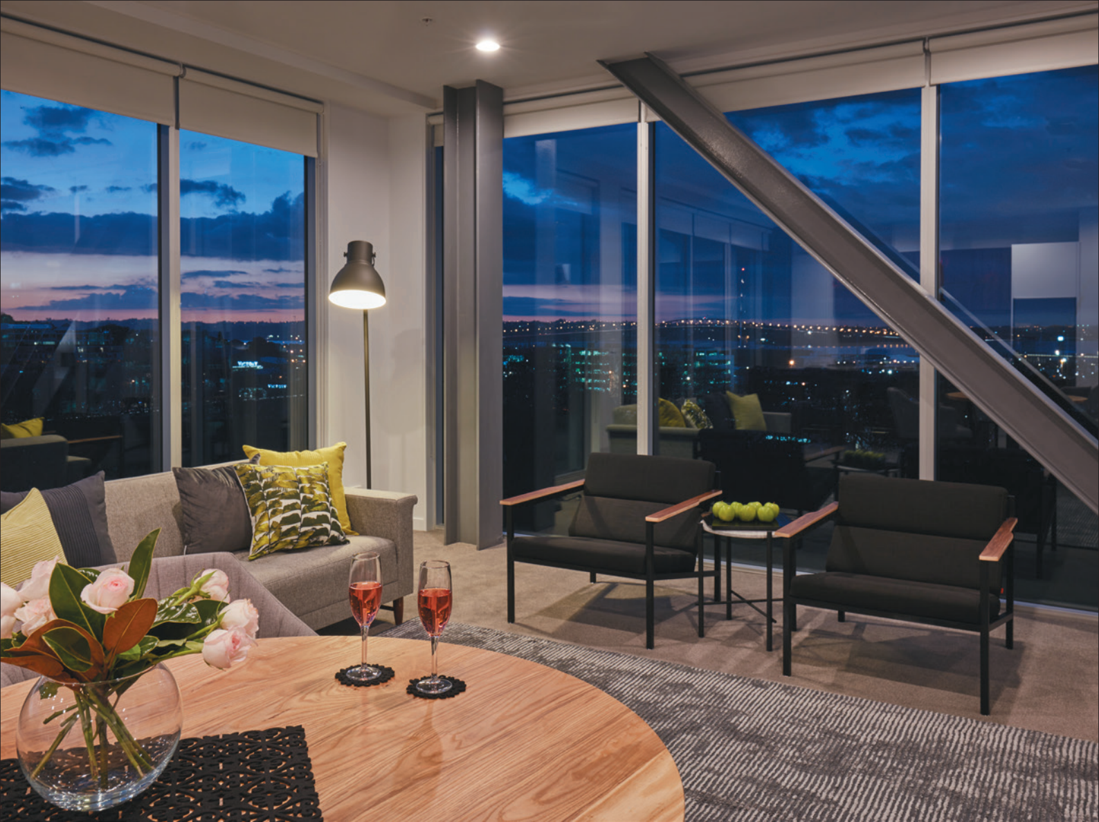
Project: Swiss BelHotel Suite – Auckland