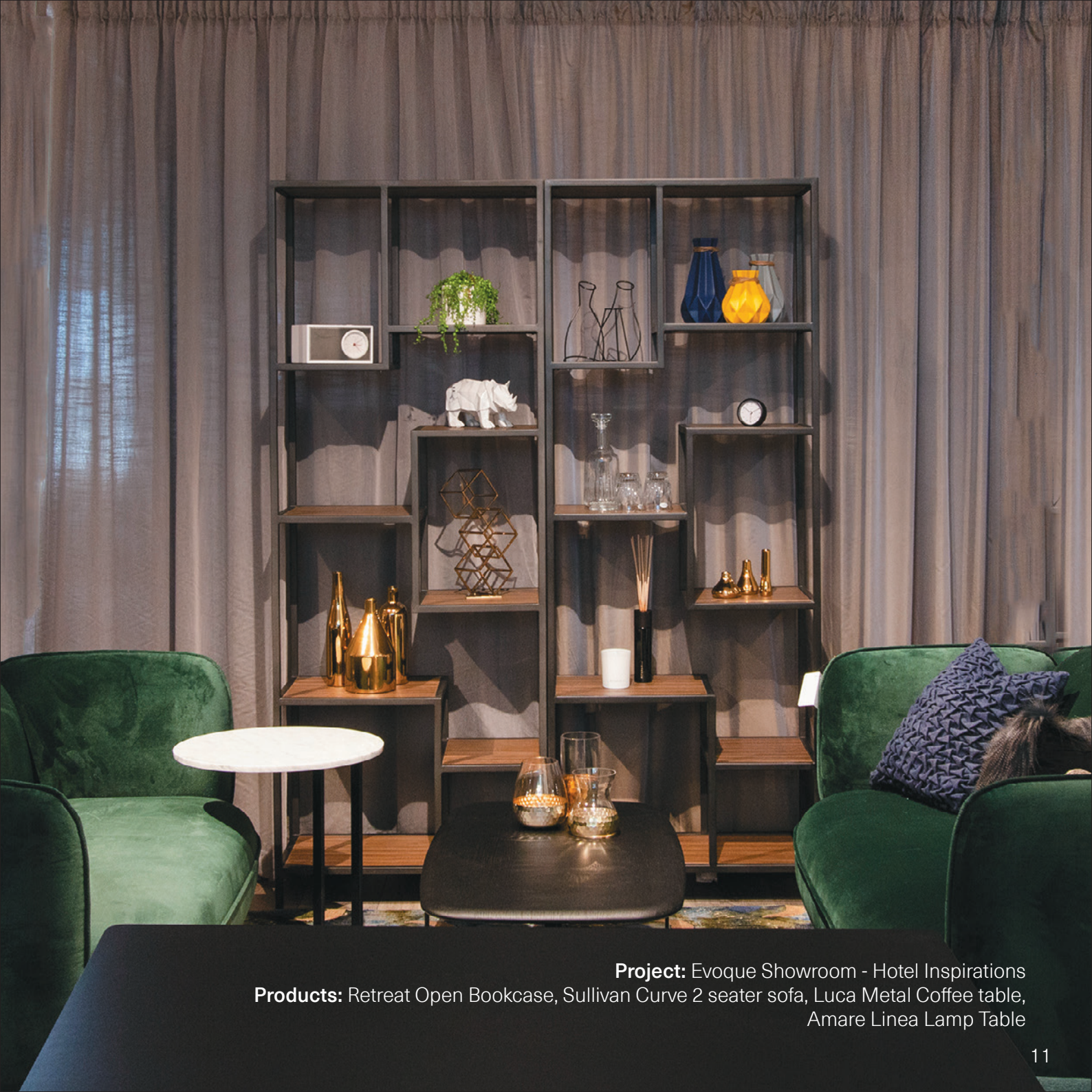
Project: Evoque Showroom - Hotel Inspirations Products: Retreat Open Bookcase, Sullivan Curve 2 seater sofa, Luca Metal Coffee table, Amare Linea Lamp Table