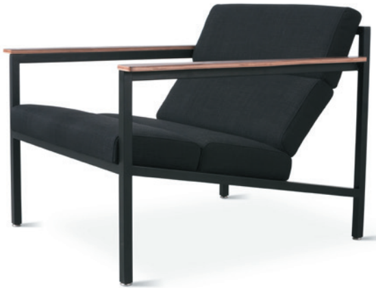
Gus Modern from Canada